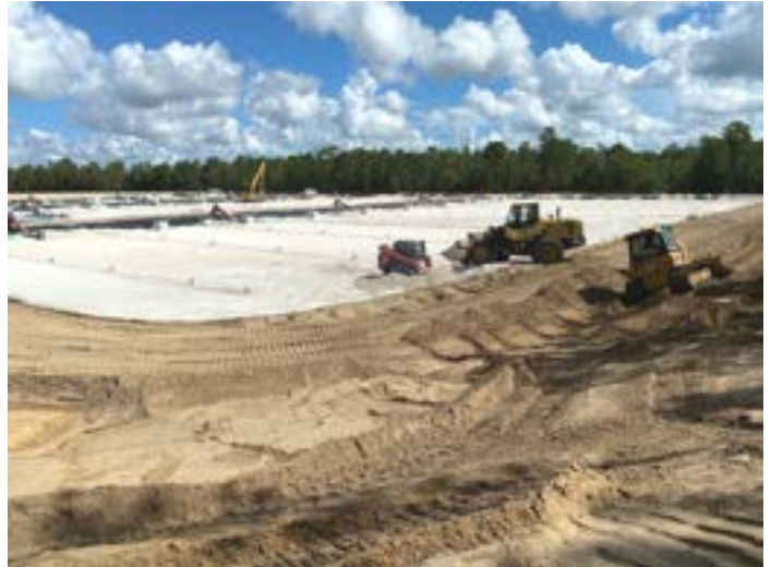
BLACK CREEK PROJECT: Top - Pump Station, only paving the driveway and erecting the fence remain. Left - Black Creek on 8/6/24. Right - The lower rock layer is being placed and graded in the Treatment Area.